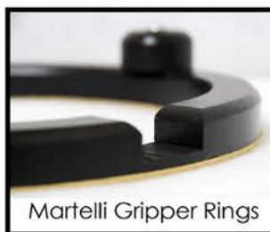
Martelli Gripper Rings

Martelli Gripper Rings are an essential addition to your longarm model!